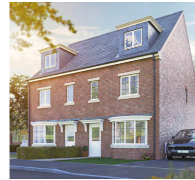
The Solway 3-bedroom home