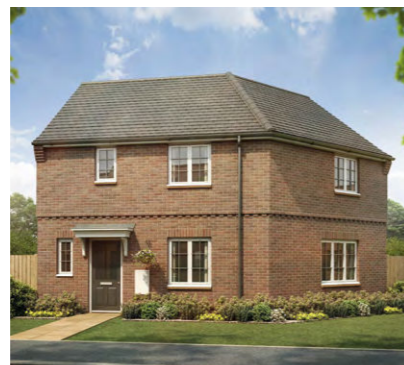
The Douglas 2-bedroom home