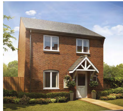
The Dove 3-bedroom home