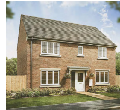
The Solent 2-bedroom home