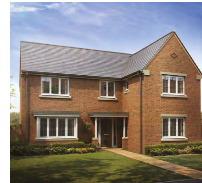
The Medway 4-bedroom detached home