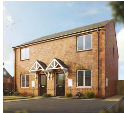
The Rother 2-bedroom home