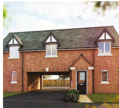
The Glen 2-bedroom home