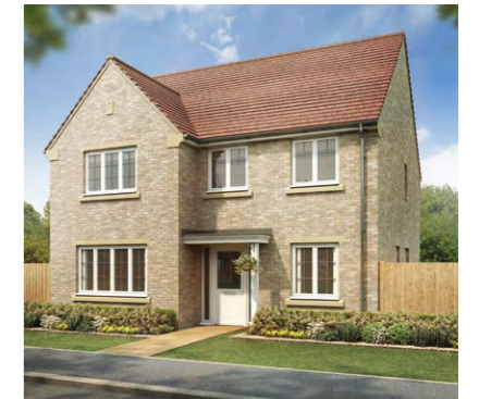
The Severn 4-bedroom detached home