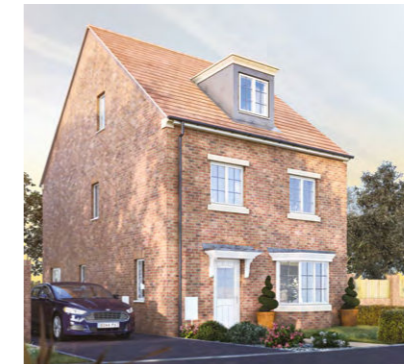
The Sherford 4-bedroom detached home