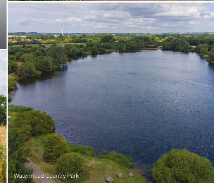
Watermead Country Park

As part of a sustainable urban extension consortium of approximately 2000 homes, our stunning new development consists of 146 plots that offer an excellent choice of 2, 3, 4 and 5-bedroom homes, all beautifully designed inside and out.