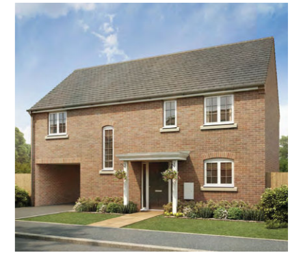
The Rannoch 4-bedroom home