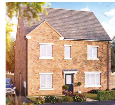
The Stonethwaite 5-bedroom detached home

Our incredible expertise, craftsmanship and attention to detail is what makes the William Davis difference. Symphony fitted kitchens, Smeg appliances and Roca ceramics ensure every home is built with quality in mind.