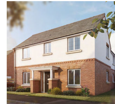
The Beamish 4-bedroom detached home