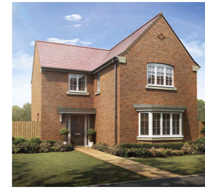
The Soar 4-bedroom detached home