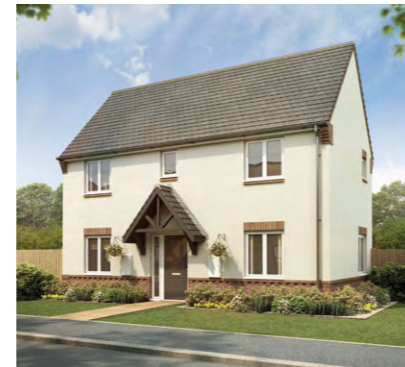
The Teme 3-bedroom home