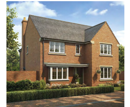
The Seaton 4-bedroom detached home