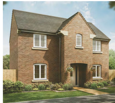
The Nene 3-bedroom home