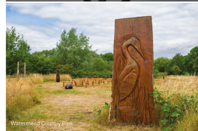
Watermead Country Park