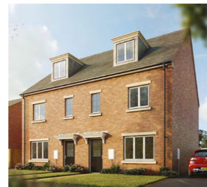
The Henmore 3-bedroom home