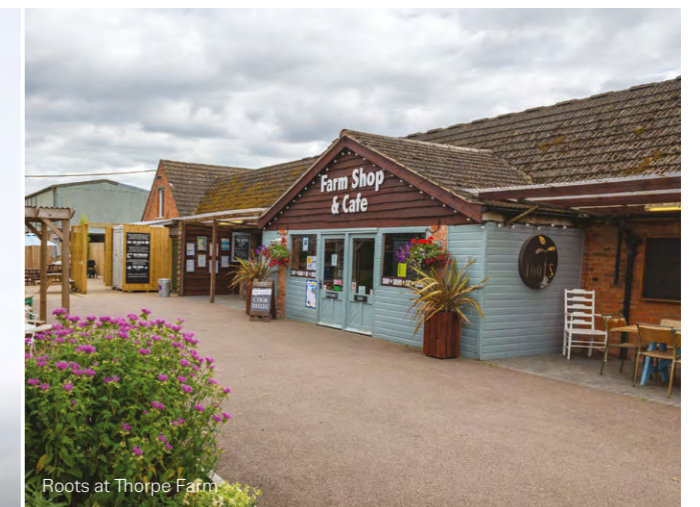
Roots at Thorpe Farm