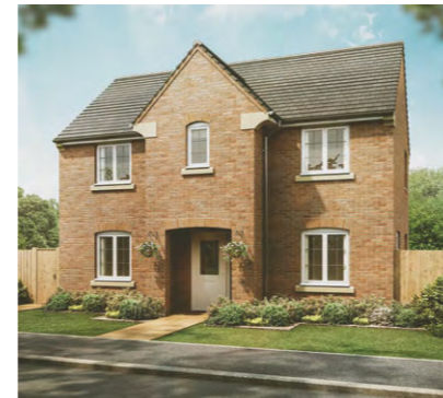
The Dee 3-bedroom home