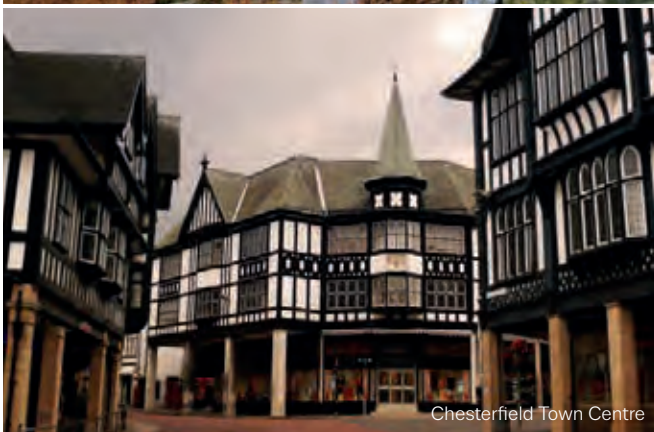
Chesterfield Town Centre