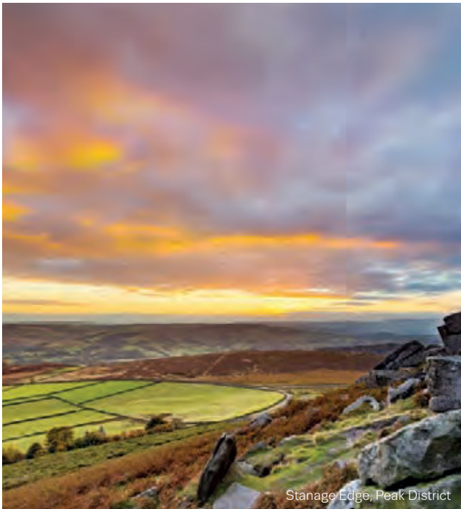
Stanage Edge, Peak District

Nestled in the beautiful county of Derbyshire, just on the edge of the Peak District, Skylarks is surrounded by fresh, open countryside and natural beauty. It's also extremely well-connected, only 5 minutes from the market town of Chesterfield and a short drive from Sheffield. Families will find it a dream spot to settle and grow, while young professionals and those working in the city will relish the escape at the end of a long week. With something for everyone, what will it offer you?