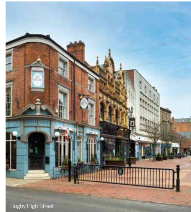
Rugby High Street

With an excellent choice of schools, a GP and a local supermarket all nearby, everything you need is right on your doorstep. Enjoy getting out and about at the local farm, play parks, eateries and nature trails, which are all within walking distance. Rugby's town centre hosts many independent shops, supermarkets, cafes and bars and is just a 10-minute drive away. And if you want to venture even farther out, Houlton is near the M1, M6 and M45, making it the perfect location for your family.