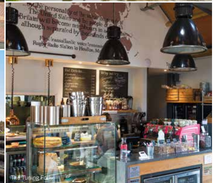
The Tuning Fork

If you're looking for a home with a great sense of community for your growing family, Houlton is the perfect choice for you. The stunning development of 146 plots offers an excellent choice of 2, 3, 4 and 5-bedroom homes, all beautifully designed inside and out.