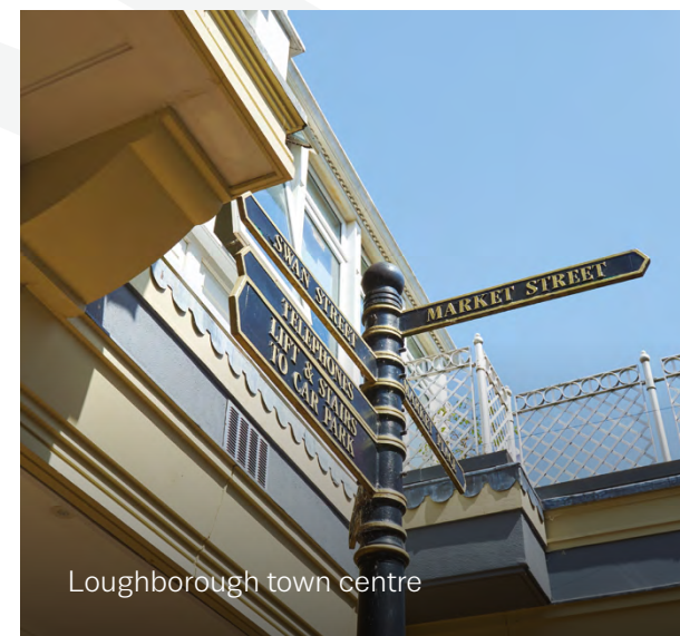
Loughborough town centre