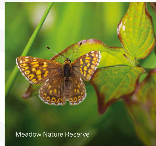
Meadow Nature Reserve

Hathern and the surrounding area offer plenty to enjoy, starting with welcoming local pubs like The Kings Arms and The Anchor Inn, where you can relax with great food, local ales, and regular live events including quizzes and live music. For those seeking more cultural experiences, nearby Loughborough boasts a vibrant arts scene with theatres such as the Carillon, art galleries, and music venues hosting everything from classical concerts to contemporary performances. Community events, festivals, and workshops are held throughout the year, making it easy to get involved and enjoy creative activities for all ages. Whether you're looking for a relaxed evening out or a lively cultural outing, the area has something to suit every taste.