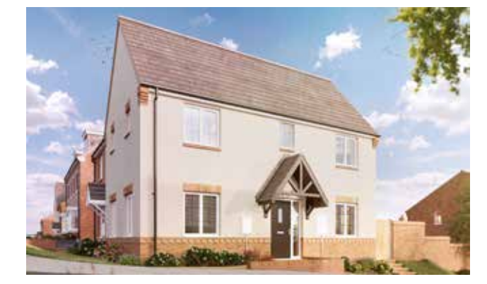
The Teme 3-bedroom home