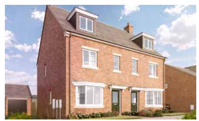
The Solway 3-bedroom home