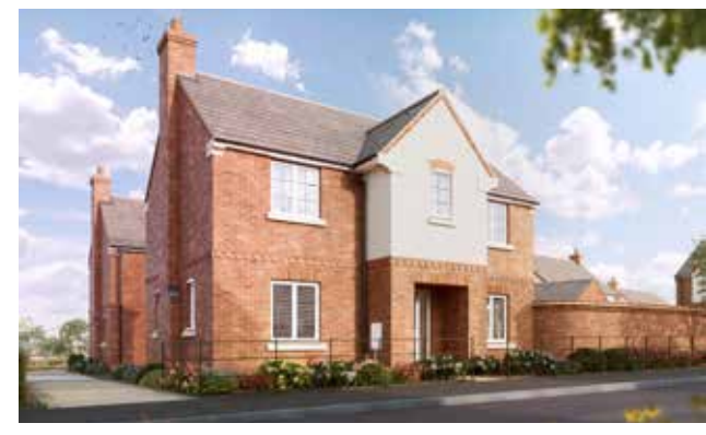
The Dee 3-bedroom home