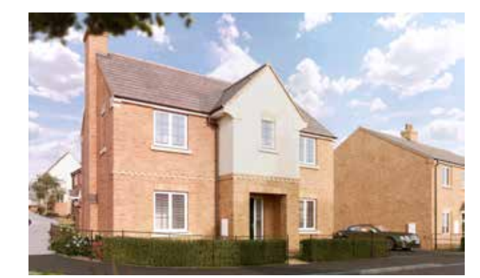
The Nene 3-bedroom home