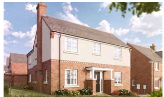
The Beamish 4-bedroom detached home