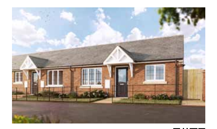
The Glaven 2-bedroom home

We have 12 different house types ranging from 2 to 4-bedroom homes. Discover more details, including floorplans, specifications and virtual reality tours by hovering over the QR code with your smart phone.