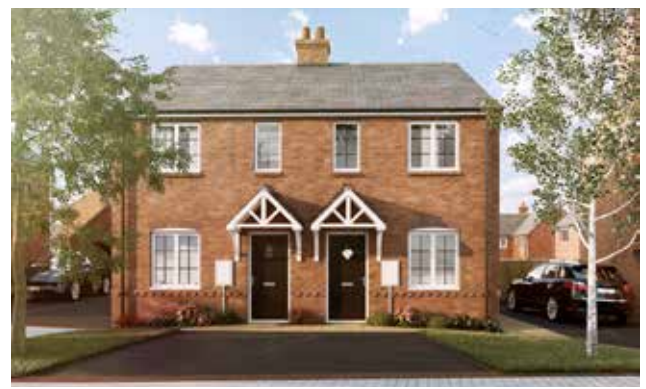
The Rother 2-bedroom home