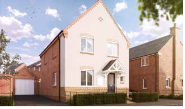
The Dove 3-bedroom home