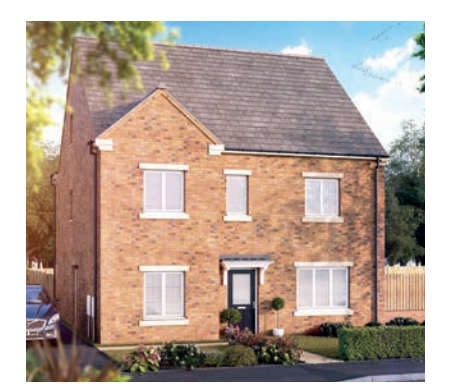
The Stonethwaite 5-bedroom detached hom