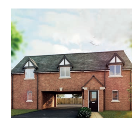
The Glen 2-bedroom home