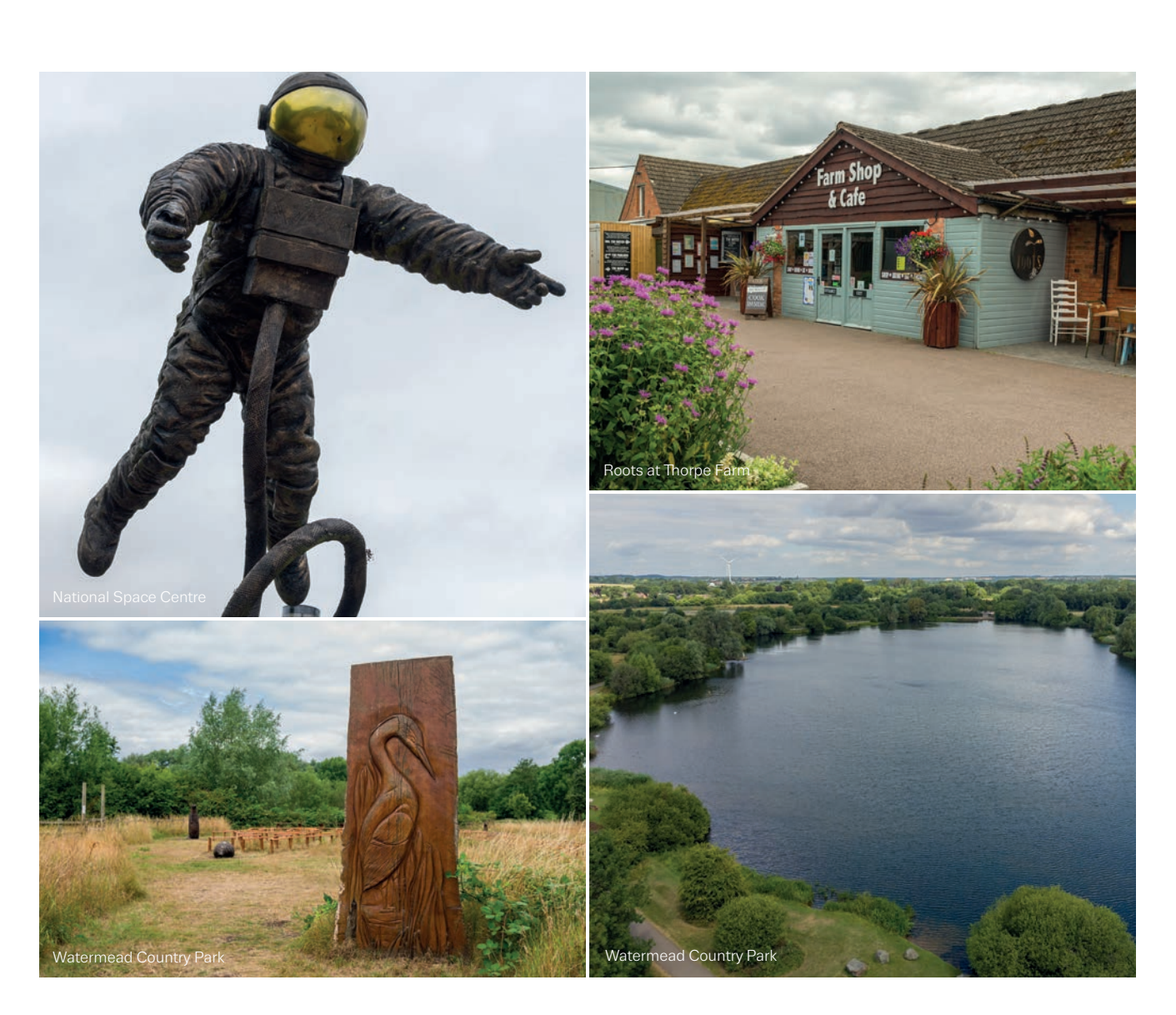
As part of a sustainable urban extension consortium of approximately 2000 homes, our stunning new development consists of 146 plots that offer an excellent choice of 2, 3, 4 and 5-bedroom homes, all beautifully designed inside and out.

With all the amenities on your doorstep – from shopping centres, salons and pubs to a farm shop, pharmacy, GPs and an excellent selection of schools – Thorpebury in the Limes has everything your family could ever need. Whether you're a couple, growing family or looking to downsize to a more peaceful location, there is something for everyone at Thorpebury.