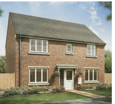
The Solent 4-bedroom detached home