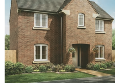
The Nene 3-bedroom home