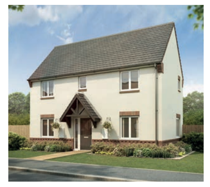
The Teme 3-bedroom home