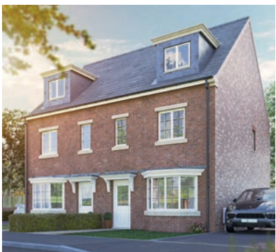
The Solway 3-bedroom home