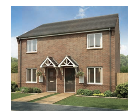
The Rother 2-bedroom home

We have 19 different house types ranging from 2 to 5-bedroom homes. Discover more details, including floor plans, specifications and virtual reality tours by hovering over the QR code with your smart phone.