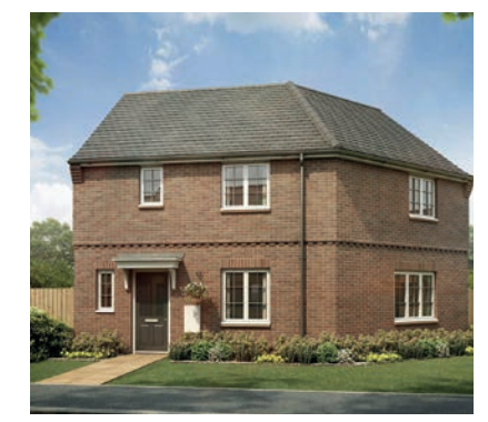
The Douglas 3-bedroom home